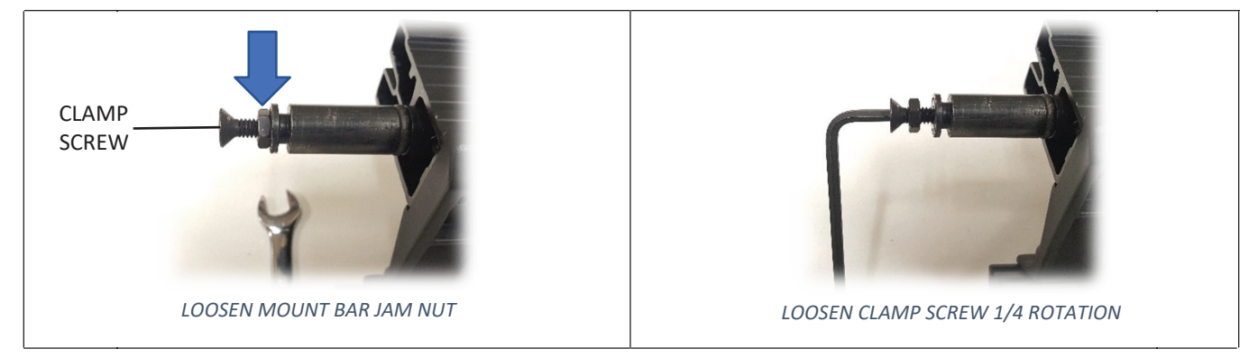
ISSUE: WHEN ASSEMBLING FRONT END, THE RISER AND MAINFRAME ARE NOT TIGHT TOGETHER.

<u>SOLUTION:</u> PULL THE RISER FROM THE MAINFRAME ASSEMBLY. LOOSEN MOUNT BAR JAM NUT WITH 7/16" WRENCH AND <u>LOOSEN</u> CLAMP SCREW BY ¼ TURN. RE-TIGHTEN MOUNT BAR JAM NUT. RETRY ASSEMBLY. IF STILL TIGHT REPEAT THIS PROCESS FOR AN ADDITIONAL LOOSENING ¼ TURN.